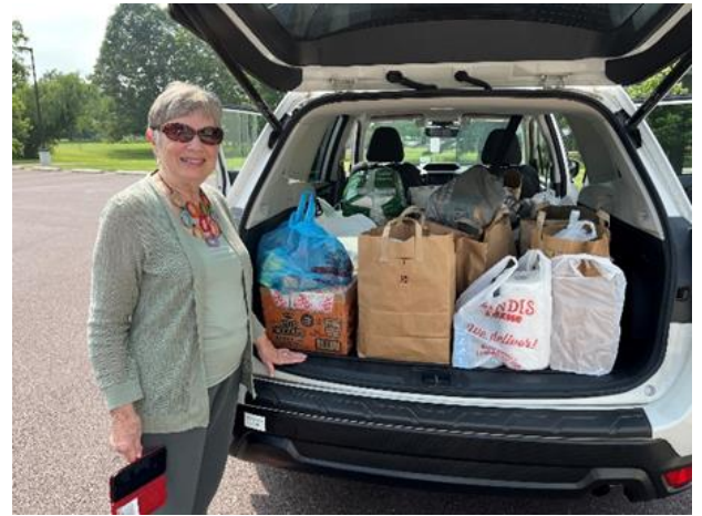
Community Club of Collegeville provided baking supplies