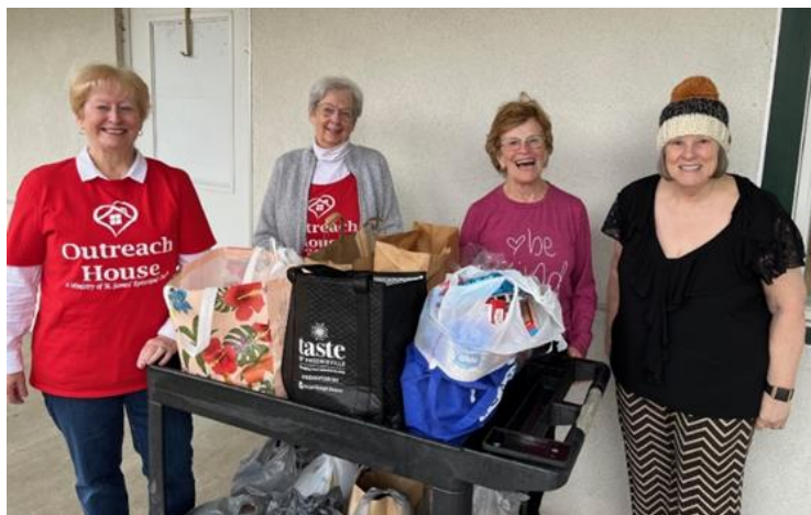
Meadowood Seniors hosted a summer food collection