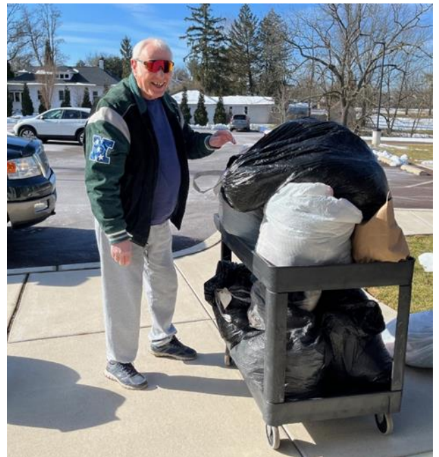
St. Paul's Episcopal Church Oaks delivered gently used apparel collected for our Clothing Room.

"To know and serve God by serving others"