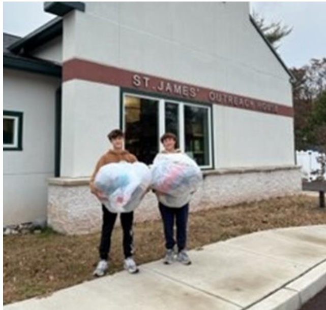
Montgomery County 4H Seeing Eye Puppy Club collected winter coats and jackets for our clothing room