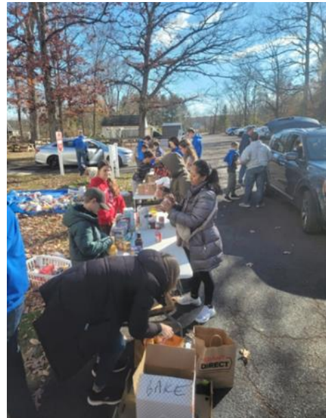
Scout Troop 119 involved the community in its annual fall food drive.