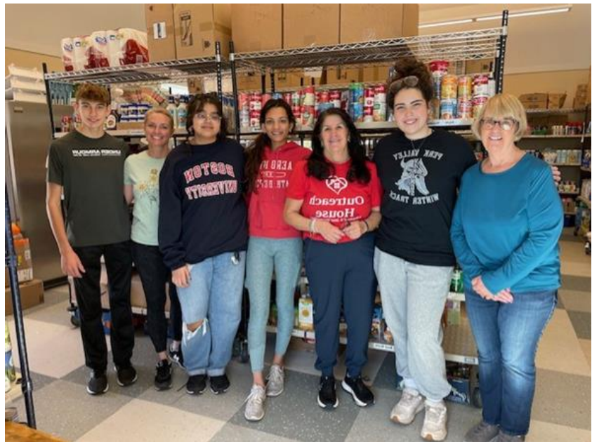
Troop 7343 worked at Outreach House to organize food collected by Troop 119.

We also thank Spring-Ford Cross Country Team, Children's School House of Collegetown, Corpus Christi Catholic School, youth from the Giving Tree, and Red Bridge Montessori House for their community service.